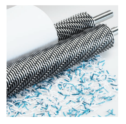
SOLID STEEL CUTTING SHAFTS

Robust and durable: high-quality paper clip proof cutting shafts with lifetime guarantee under conditions of fair wear and tear.