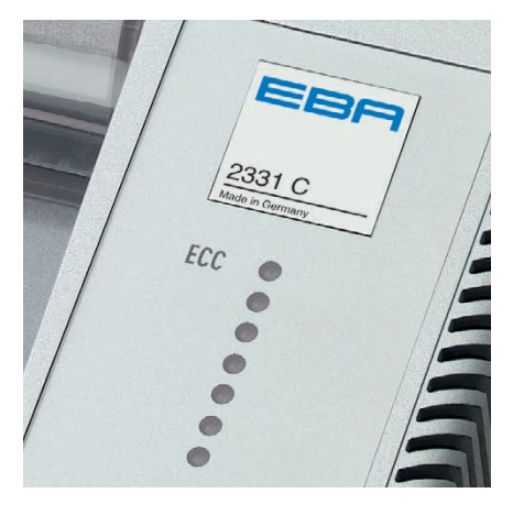
ECC - ELECTRONIC CAPACITY CONTROL This electronic feature indicates the used sheet capacity during shredding process to avoid paper jams.

Ease of operation: intelligent multifunction switch element with integrated optical signals indicating the operational status. Additional "emergency switch" function.